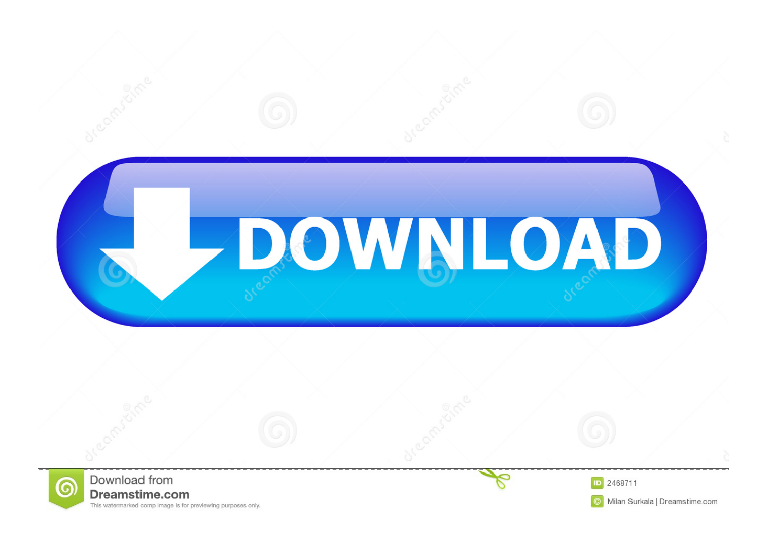
Suikoden 2 Rare Finds Gameshark Codes